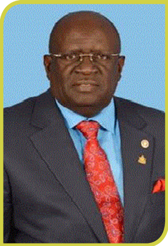
Prof. George Magoha

I want to join the entire Jaramogi Oginga Odinga University of Science and Technology fraternity in celebrating its' 8th Graduation Ceremony.