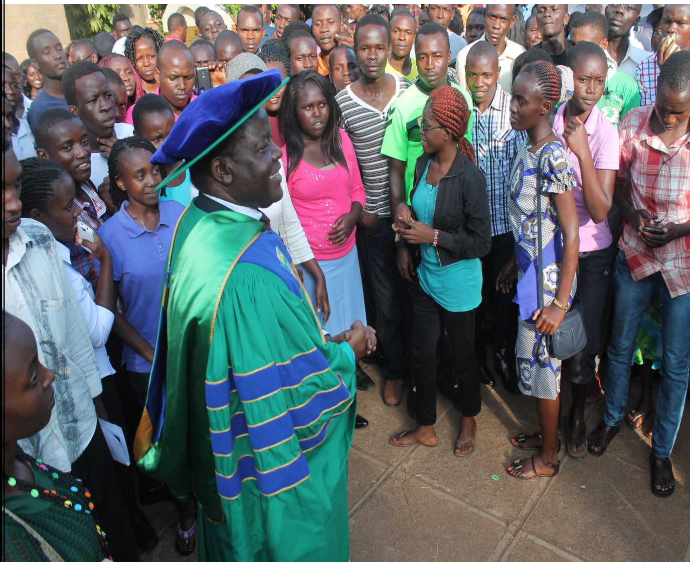
The VC addressing previous 1st year Students

Jaramogi Oginga Odinga University of Science and Technology P.O. Box 210-40601 BONDO-KENYA TEL: 057-2501804