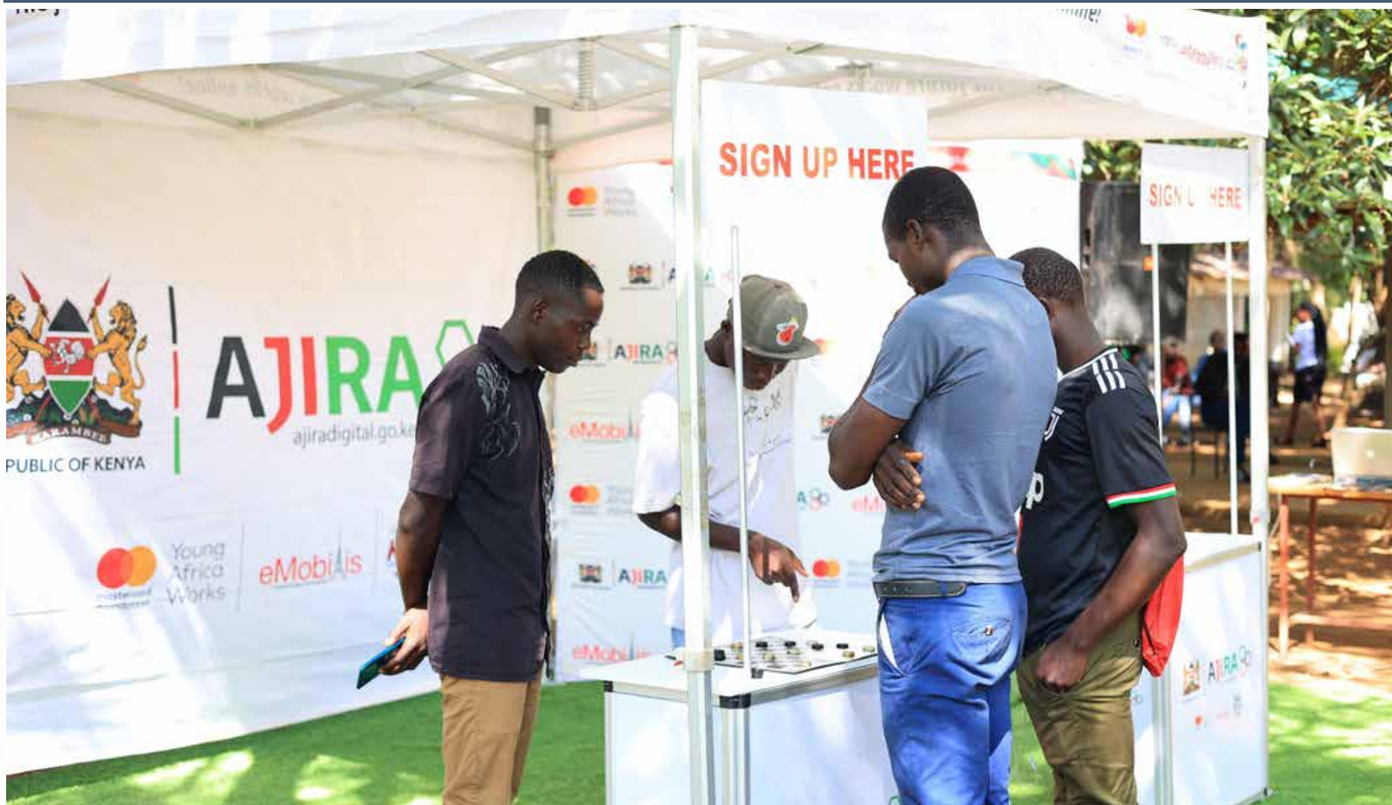
JOOUST students visit the Ajira Digital booth

I n a bid to ignite the spark of digital empowerment among the students of Jaramogi Oginga Odinga University of Science and Technology (JOOUST), the Ajira Digital Team embarked on a Digital Awareness Campaign in JOOUST on the 29 th of September, 2023. The Ajira Digital Program is a government initiative driven by the Ministry of ICT, Innovations, and Youth Affairs whose overarching goals include raising the profile of digital work, promoting a mentorship and collaborative learning approach to finding digital work, providing Kenyans with access to digital work,