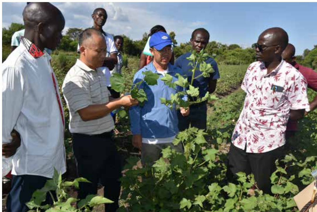
ICR-CAAS and a team of JOOUST researchers embark on a field visit to Pap-Kodero cotton farm in Rarieda