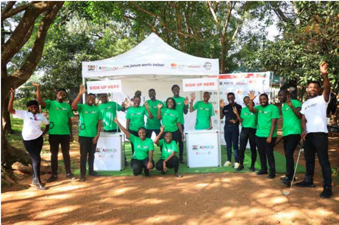
Ajira Digital crew together with JOUST Ajira Club members share a light moment at the booth