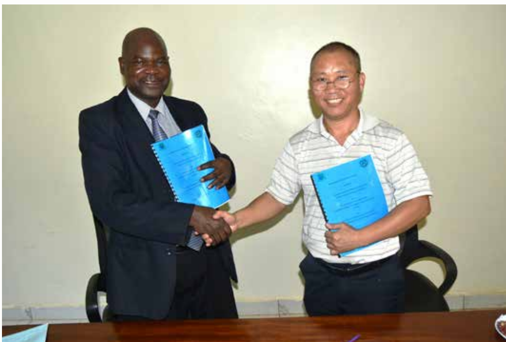
Light moment after the signing of the MoU between JOOUST and ICR-CAAS