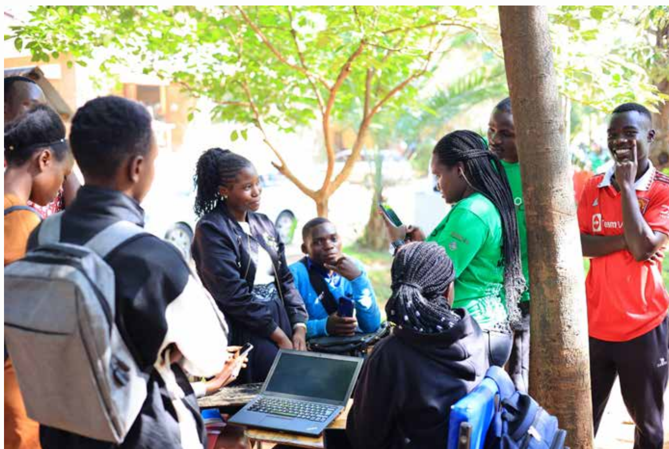
Registration for Ajira Digital programmes underway

experience for both the team and the students. This initiative promises a lot of opportunities for the Youth even as the country continues to position itself as a hub for digital innovation.