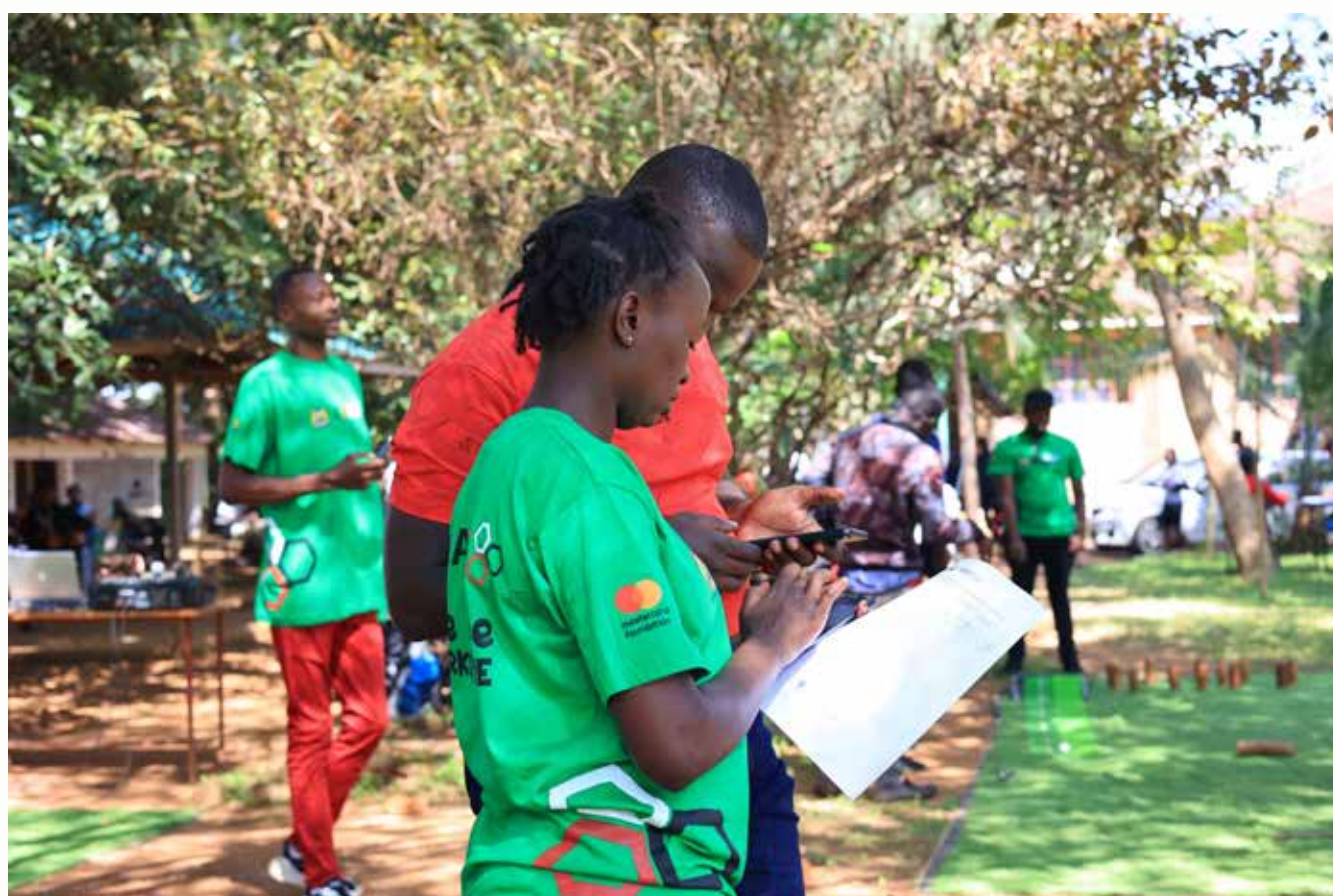
JOOUST Ajira Club member registers participant for the online courses offered by Ajira Digital