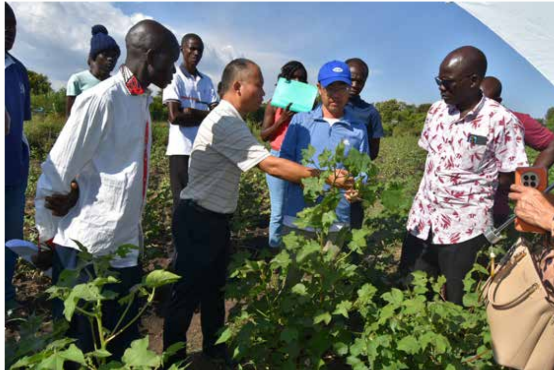
ICR-CAAS and a team of JOOUST researchers embark on a field visit to Pap-Kodero cotton farm in Rarieda