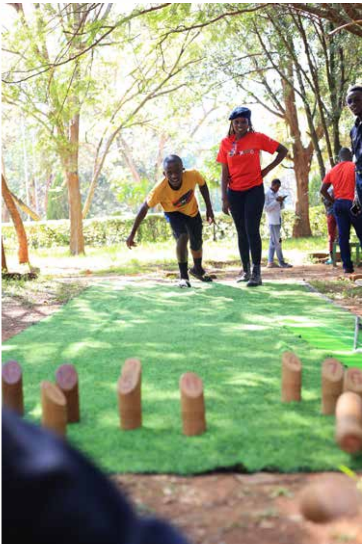
Team building activities ongoing next to the Ajira Digital booth