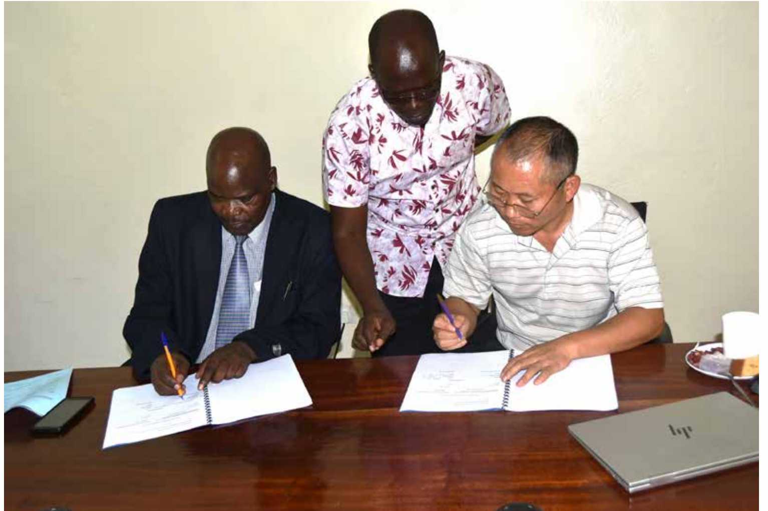
JOOUST Signs MOU with The Institute of Cotton Research, Chinese Academy of Agricultural Sciences (ICR-CAAS)

In a significant development that promises to drive agricultural innovation and scientific cooperation to new heights, Jaramogi Oginga Odinga University of Science and Technology (JOOUST) and the Institute of Cotton Research, Chinese Academy of Agricultural Sciences (ICR-CAAS) in