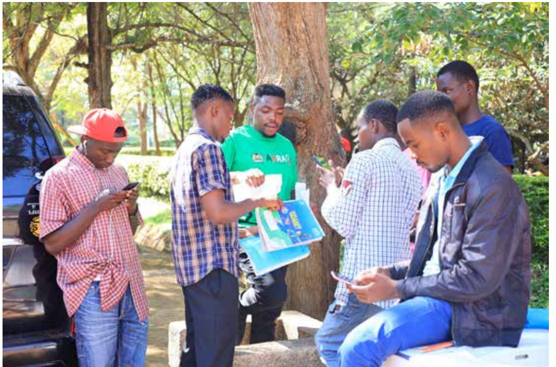
The registration process was highly interactive