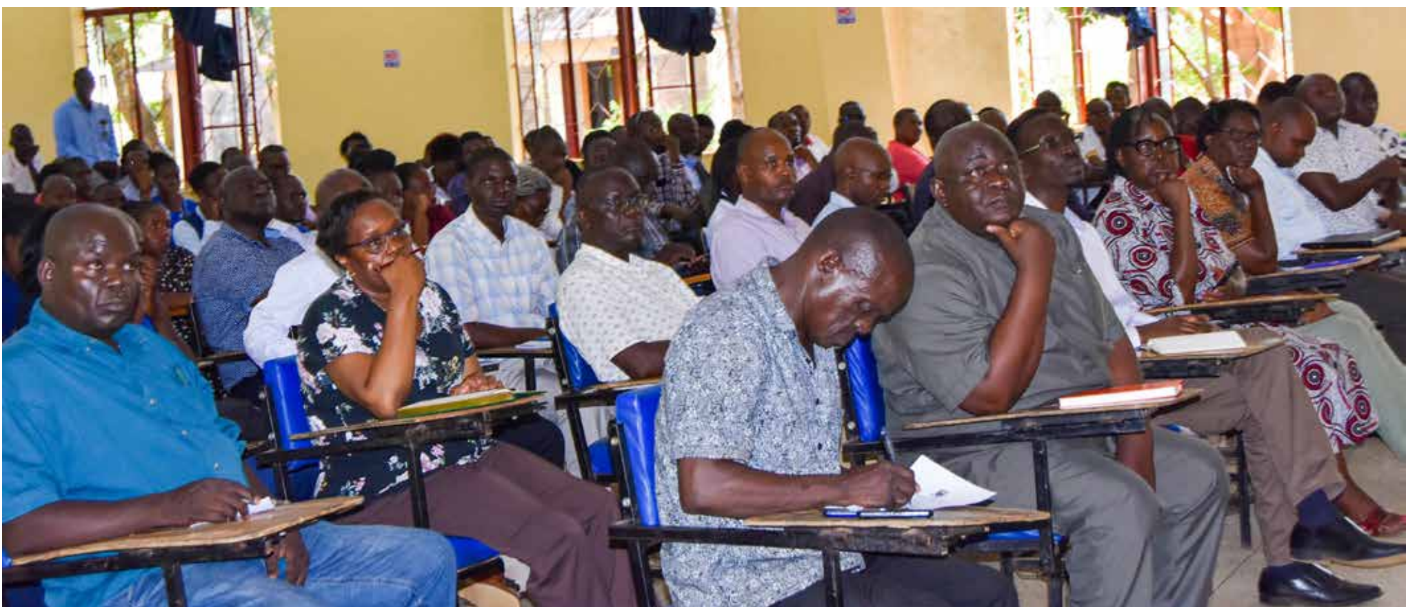
JOOUST staff members during the VC's address to staff

able to visit with some of you at your various work stations and I'm still going to come to transport, finance....., please prepare for my visit"