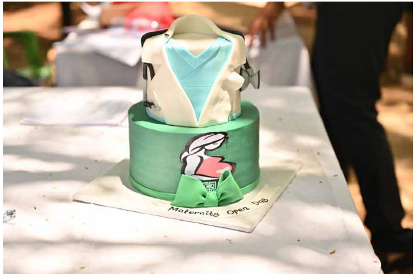
Cake cutting ceremony, courtesy of Cooperative Bank

The team was sensitized on, among other issues, the