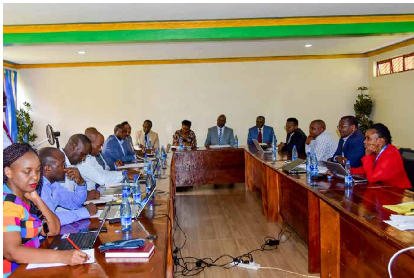
Attendees listen to a presentation on JOOUST Commercialization Masterplan

Previously, JOOUST has proudly participated in the Accelerated Research to Commercialization program, a collaborative initiative of Victoria Ventures