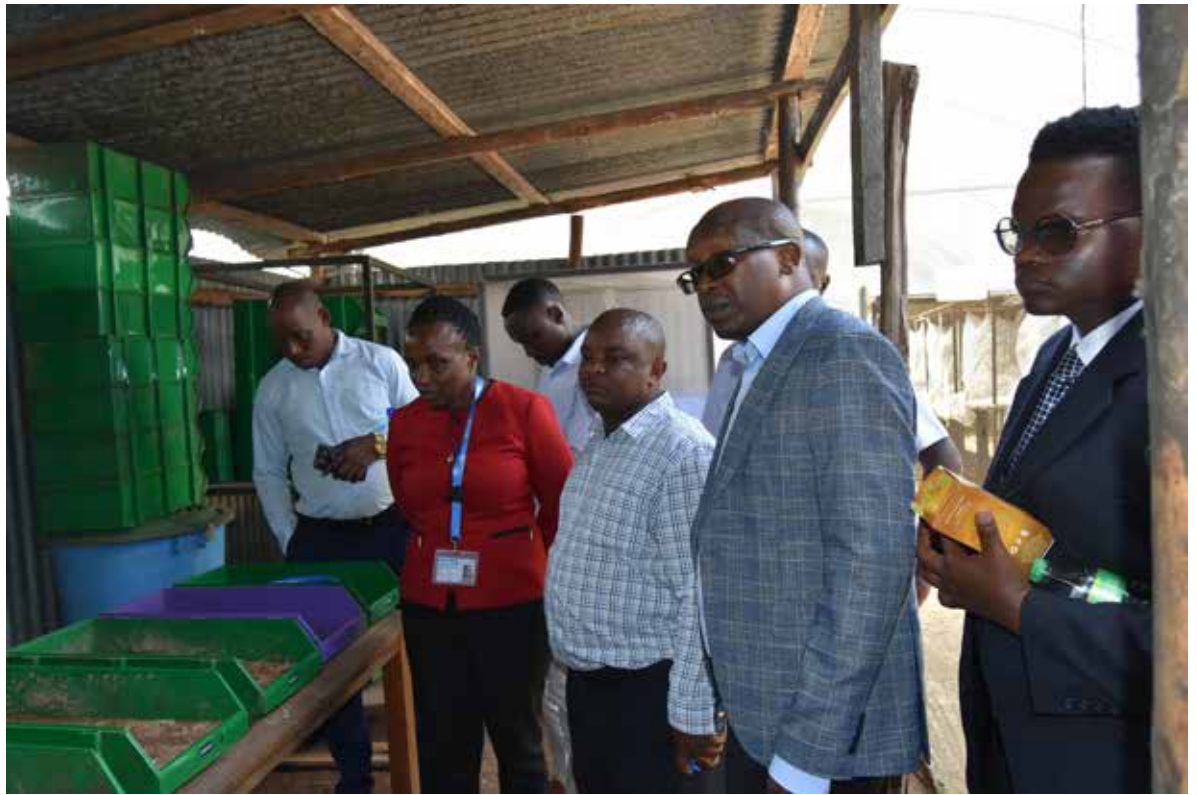
Visitors tour the various JOOUST projects

After the presentations, the guests had an opportunity of carrying out an excursion to the various inventions within the Campus with the aim of developing their own commercialization master plans.