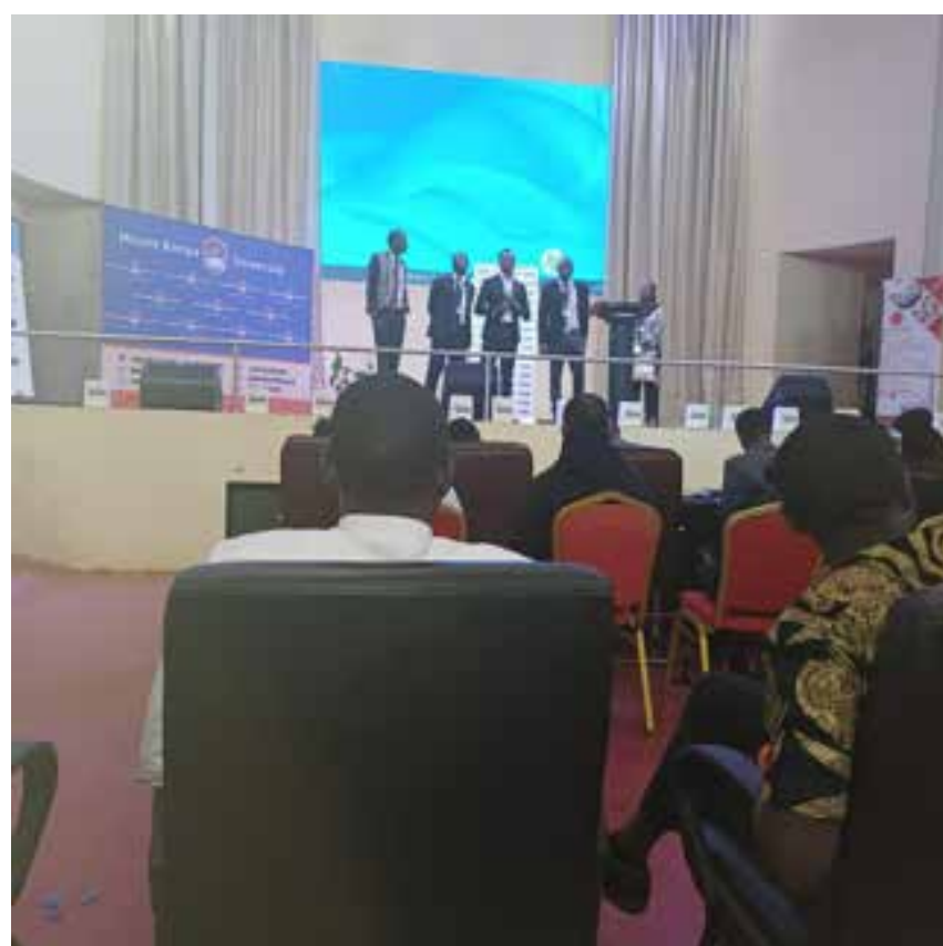
BESA members on stage showing their tech prowess on stage

change in their academic and professional pursuits. Overall, the experience left the members of the association energized, motivated, and eager to apply their newfound insights in their studies and future endeavors. JOOUST was also awarded for being the newest member of KESA