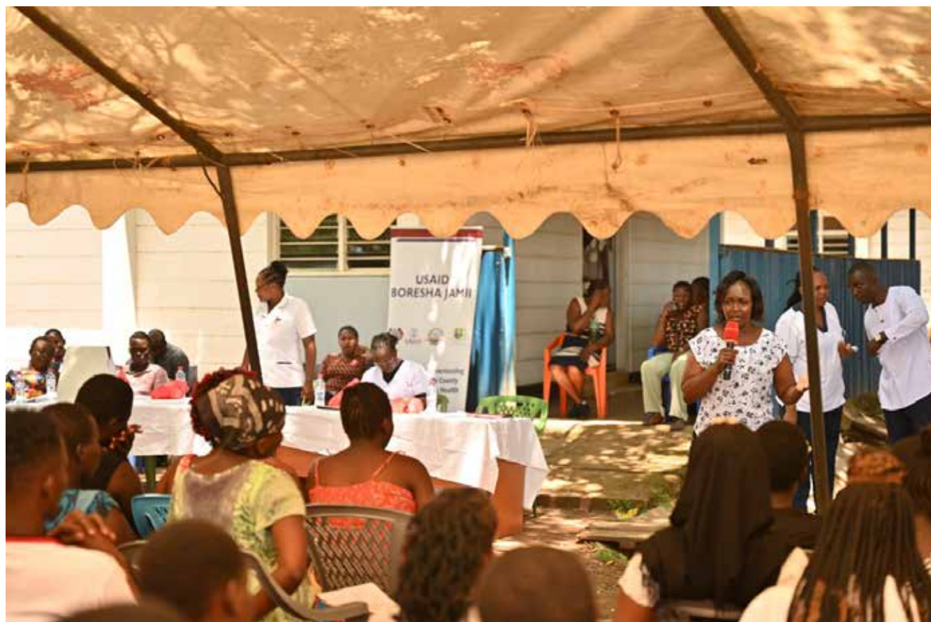
Presentations ongoing during the maternity open day in Kisumu

The event was crowned by a cake-cutting ceremony courtesy of Cooperative Bank of Kenya. Additionally, Mothers embarked on a guided tour of the hospital's maternity wing. Sincere gratitude to TINADA Youth Organization, Co-operative Bank, and Ogra Foundation for supporting this!