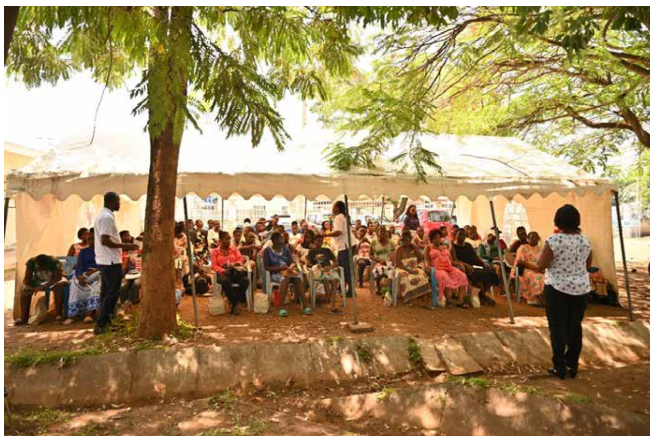
Attendees during the maternity open day

in Kisumu, Vihiga Nyamira and Kakamega counties, with funding from the United States President's Emergency Plan for AIDS Relief (PEPFAR) through the United States Agency for International Development (USAID).