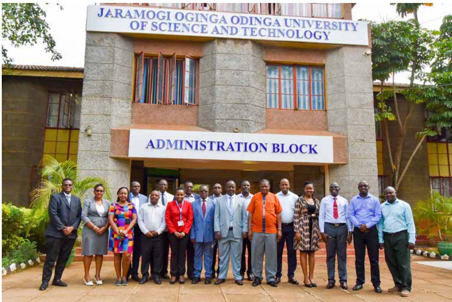
The visitors pose for a group photo in front of the Administration block with the University Management