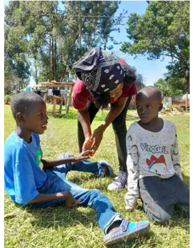
Charity club member interacts with the children

The team also engaged with the kids in various activities, including washing clothes and utensils, cooking, playing, as well as mentorship talks with the children who were keen and eager to learn from