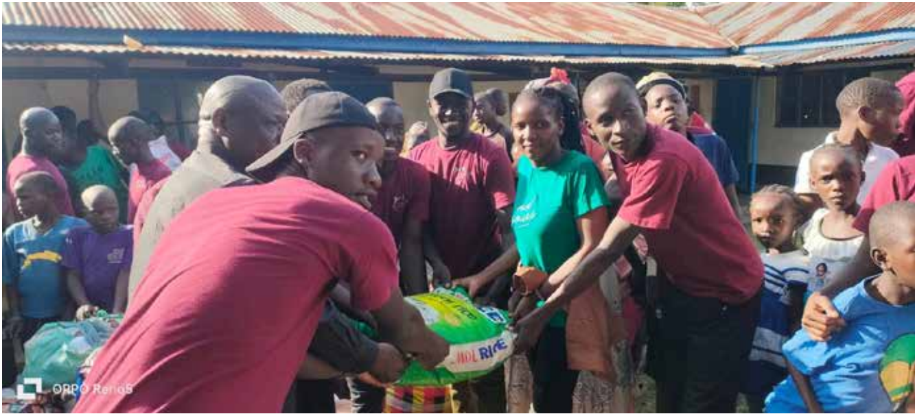
Charity Club members donate food items to River Jordan Ministry Children's home